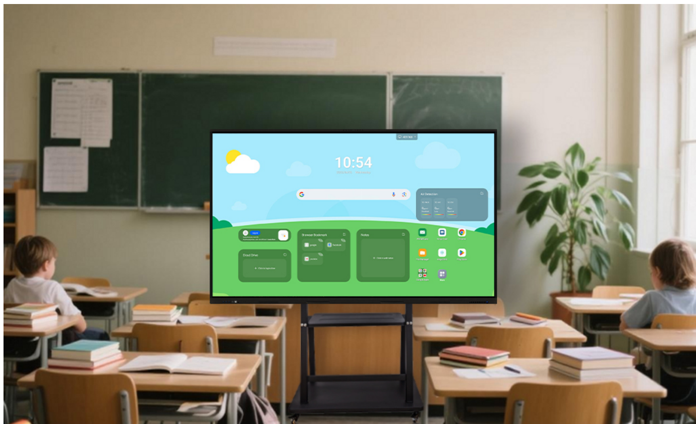
Movable Stand MT02