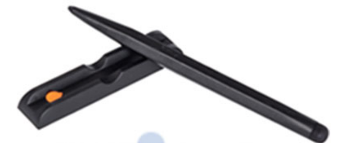
Pen with two tips